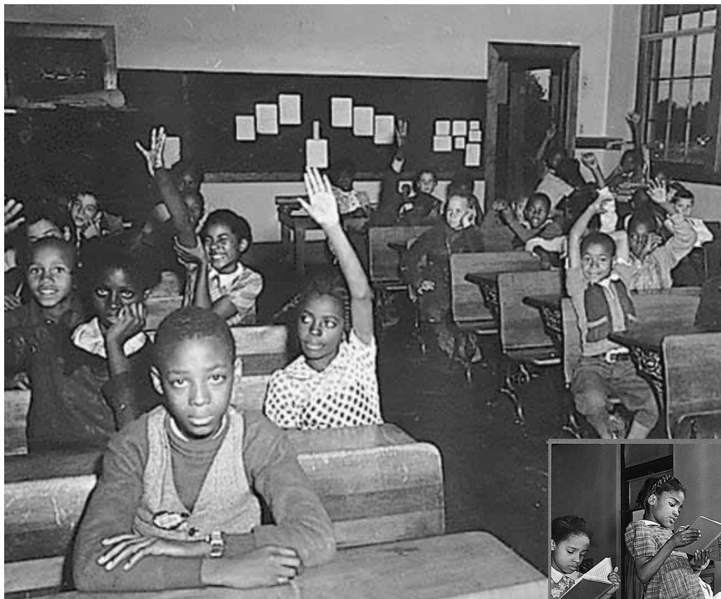
Lincoln School in Canton, MO may teach children again.